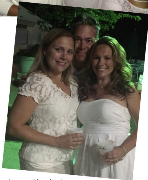
Flyer designed by Sharlene Monroe