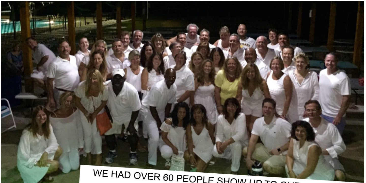
WE HAD OVER 60 PEOPLE SHOW UP TO OUR FIRST WHITE PARTY JULY 11 and everyone had a FABULOUS time !!