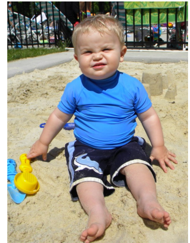
TODDLER TIME !!