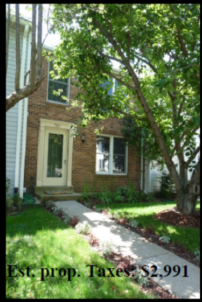
Est. prop. Taxes: $2,991